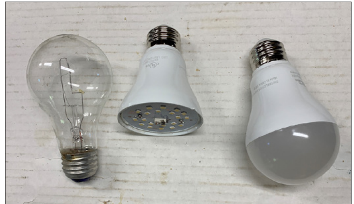
Figure 1. Incandescent (left) and LED lamps (center, with globe removed, and right).

In less than a decade, the entire world (poultry industry included) has made a dramatic shift from incandescent lamps to dimmable LED lamps. Despite some growing pains along the way, the energy savings and long-life potential of LED technology made the frustration worth it. However, within the poultry industry during the past 8 to 10 months, widespread problems with rapid