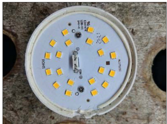
Figure 2. LED lamp with globe removed to show LED chips.

lumen depreciation, erratic dimming performance, and premature total lamp failure have been reported on LED lamps that were only 2 to 3 years old; in many cases, several years before the warranty had expired.