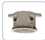
Item No. - 703 Surface Mount Junction Box