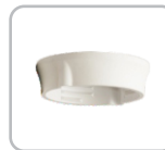
Item No. - 653 Adapter For 4" Junction Box