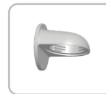
Item No. - 702 Wall Mount Junction Box